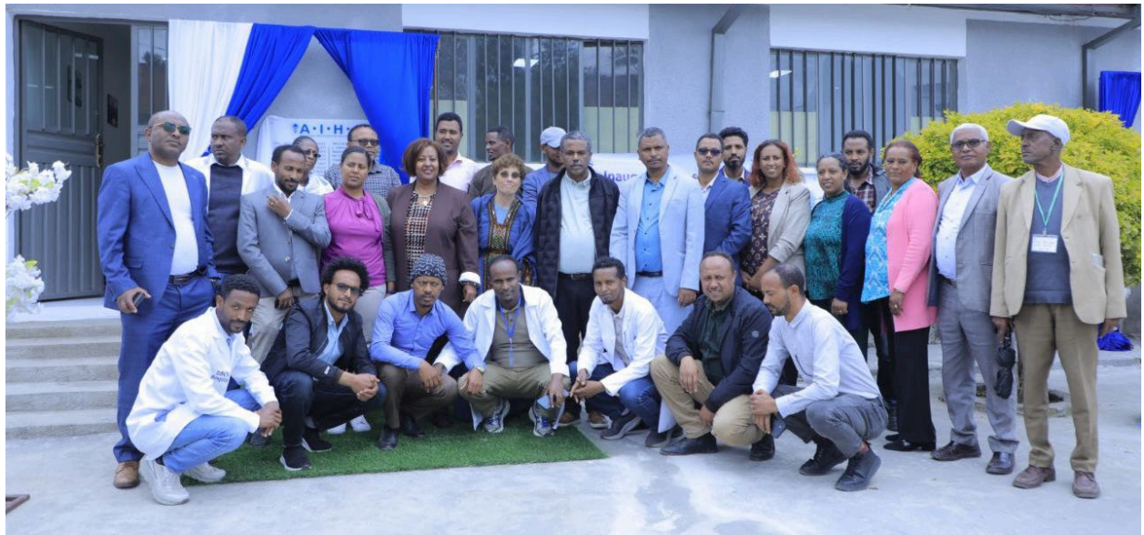
Commemorating the official opening of the CPD Center and Nursing Skills Lab.