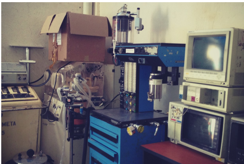
According to PEPFAR estimates, as much as 48 percent of Ethiopia's hematology, CD4, and microbiology lab equipment is not working at any given time, which greatly hinders the country's HIV response.

Leveraging the success of this innovative partnership, AIHA recently launched a public-private partnership with GE Foundation to help scale up and complement current partnership activities.