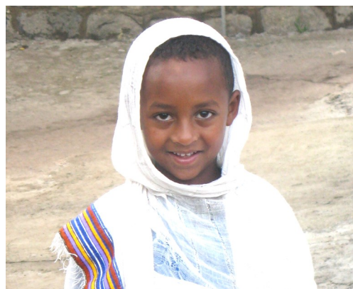
AIHA's social work partners trained more than 742 psychosocial care workers to provide much-needed care and support to orphans and vulnerable children, as well as other vulnerable populations in seven regions of Ethiopia.

Because Ethiopia has been so heavily affected by the HIV/AIDS epidemic, the Federal Government and international donors alike have increased resources to strengthen human and organizational capacity to support the implementation of prevention, care, and treatment programs. Partners at Debre Berhan Referral Hospital and Elmhurst Hospital Center collaborated from 2007 to 2014 to strengthen Debre Berhan's capacity to provide medical and psychosocial care for PLHIV.