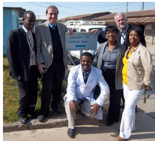
The hospital partnership linking Elmhurst and Debre Berhan has had a lasting impact on both sides.

Key areas of collaboration between the Ministry of Health and Liverpool VCT were focused on policy development, quality assurance, and the creation of resource materials for staff and patient education. Under AIHA's leadership, a core team of in-country partners was established in December 2010 with the objective of further enhancing the quality of HIV counseling and testing services throughout Ethiopia and to help expedite the development and implementation of a new HIV Counseling and Testing National Quality Assurance Manual. Members were selected by the Ministry of Health and included representatives of Ethiopia's HIV Counseling and Testing National Technical Working Group, CDC/Ethiopia, the Ethiopian HIV/AIDS Counselors Association, and the Ethiopian Health and Nutrition Research Institute (EHNRI), and other key stakeholders in HIV/AIDS education, prevention, and treatment. In addition, AIHA has provided significant technical contributions toward the development of a broad range of HIV counseling and testing manuals and policy papers, including the Stress and Burnout Management Manual (August 2011); the National VCT Curriculum (August 2011); the VCT Trainers Manual (September 2011); and the HCT Participant Manual (September 2011). AIHA's technical experts also helped develop other resources, such as guidelines for couple's counseling; working with MARPs; home-based HTC; mobile VCT; PICT; PMTCT; and comprehensive HIV counseling and testing trainer and participant manual.