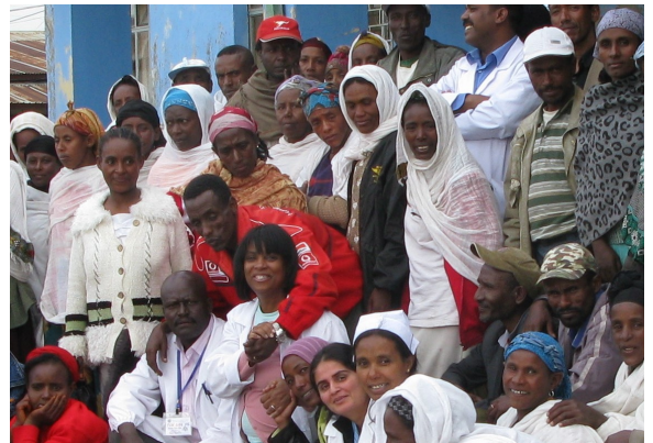
Elmhurst partners with staff and patients at Debre Berhan.

From 2008 to 2012, AIHA supported the Ethiopian Ministry of Health's efforts to expand HIV counseling and testing services, first tapping into the expansive knowledge and technical expertise of Liverpool VCT, an NGO based in Nairobi, Kenya, and later providing direct technical assistance.