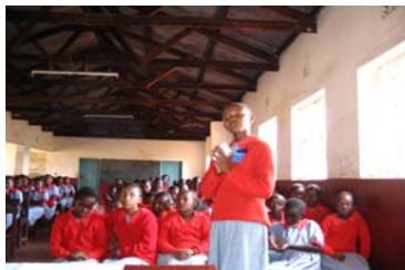
Catholic school students from Nairobi openly discuss HIV/AIDS and share information about how to protect themselves from infection as part of the abstinence and behavior change programs initiated by the KEC-CS/DePaul partnership.

The Kenya Episcopal Conference-Catholic Secretariat (KEC-CS) and Chicago's DePaul University are working together to address the growing rate of HIV/AIDS among Kenyan youth.