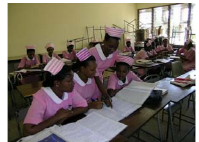
Nursing students at Muhimbili University College of Health Sciences School of Nursing learn about HIV/AIDS care and life skills.

training in HIV/AIDS care, as well as the life skills necessary to keep the nurses themselves healthy. They are also working to develop a core group of faculty members who will serve as national trainers and leaders capable of leading their country's efforts to combat HIV/AIDS in years to come.