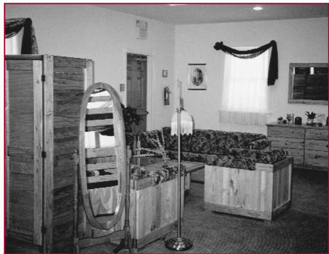
Youth members also helped choose the decorations for the girls' dormitory and its common room, shown above.

increase in its Russian-American population. Currently about 30 percent of the members receiving treatment are first generation Russian-American immigrants. Fortunately, therapeutic community philosophy and teachings are malleable enough to be tailored to a variety of international and intercultural perspectives. The treatment seems to be working for Russian and Russian-American members as evidenced at a recent Dynamic Youth graduation ceremony, where 65 percent of the program graduates were Russian-American. This is a significant accomplishment, for many of these members spoke very little English when they entered the treatment program three years ago.