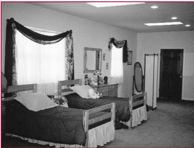
The girls' dormitory, the newest building at the residential center, was designed and built by youth members and staff. It was completed in April 2000. There are both dormitory rooms (above) and shared common areas (right).

tions and standards. The length of stay in a therapeutic community varies, but generally ranges from 12-24 months, and may last up to 36 months depending on the adolescent's circumstances. All treatment within the community is highly individualized, therefore counselors must have a good understanding of each member's personality traits and characteristics. For this reason, recovered addict professionals are essential in therapeutic community treatment.