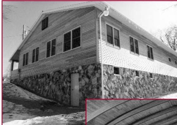
The youth members and staff designed and built the schoolhouse (above) and the gymnasium (right), which are on the grounds of the Dynamic Youth resident center.