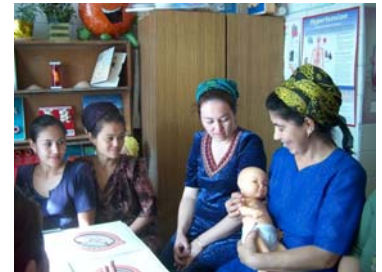
Patient education and outreach, such as this class for expectant mothers, plays a key role in the provision of quality primary care.

Some 1,000 medical school instructors and healthcare professionals from Ashgabat have earned diplomas from the center. Among them is a team of instructors for a second Family Medicine Training Center, which — thanks to USAID and AIHA support — opened in December 2005 at the Scientific Center of Physiology to provide training to healthcare practitioners from rural areas spanning Turkmenistan.