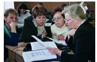
Participants at a palliative care workshop in St. Petersburg discuss case studies during a group exercise.