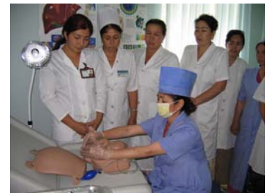
An instructor at the Scientific Center of Physiology Family Medicine Training Center demonstrates birthing techniques to a group of practitioners from Turkmenistan's outlying regions.